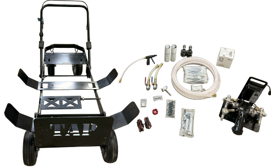
TRUFAST-TAP Pump System Complete Kit - TAP0001K