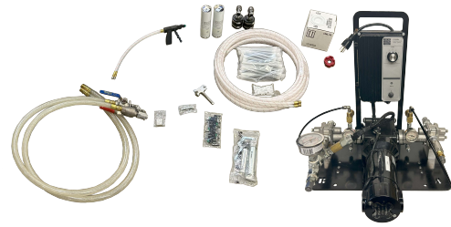
TRUFAST-TAP Complete Pump Assembly Total Kit - TAP0012K